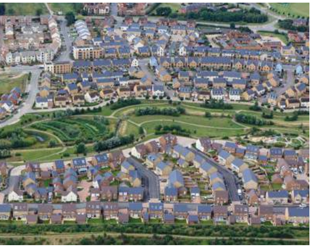
Brooklands Estate, Milton Keynes